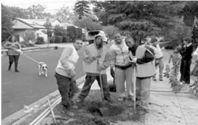
A crew from Stanford, planting in Redwood City

Department of Redwood City and hosted an open public tree-pruning workshop. From this event, a corps of trained tree pruners was recruited and began a maintenance program for the trees planted a few years earlier. The group has now pruned and maintained over 300 trees. CityTrees also completed a pilot tree-planting project with a group from the unincorporated area of Redwood City, the Fair Oaks Beautification Association. This was the first time CityTrees planted outside the City limits and did not have the